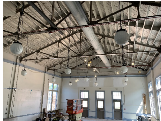
Media Center Lights