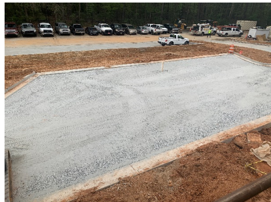
South Elevation GAB