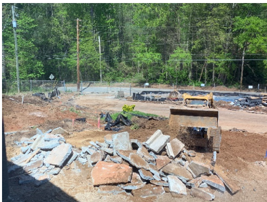
Site Demo At Main Entrance