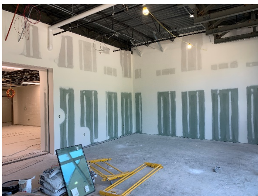
Drywall in STEM Lab