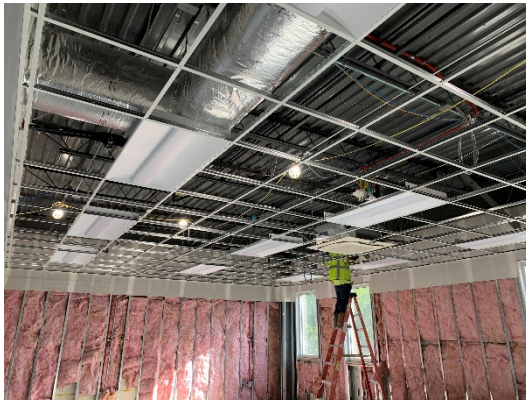
New Addition Ceiling Grid